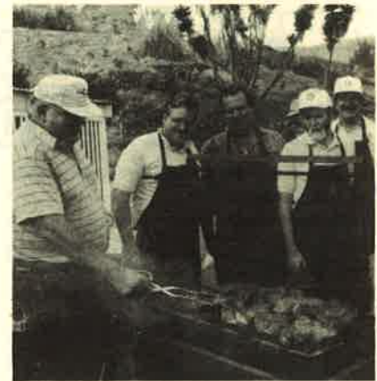
The Ventura Marina Rotary Club donated and prepared the tasty BBQ.

Thanks to all the businesses that donated to the BBQ and the door prizes: Noren's Market; The City Bakery; Royal Bakery; Casa Mañana; The Honeybaked Shop; Eastland Hallmark; Karen's Hallmark; First United Methodist Church; Ventura Party Rental Center; Holiday Party Rentals of Simi Valley; Basso Distributing; Marie Callender's, Ventura; Sea Things; and Procter & Gamble.